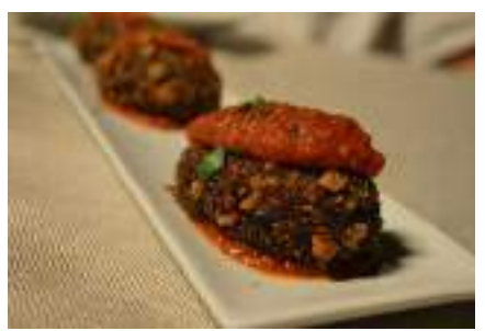
Crocchette di melanzane

The two must-try dishes at Da Cesare are delicious starters sure to win over anyone who tastes them. The first dish is the polpette di bollito , shredded beef brisket meatballs, with a pesto sauce and shredded pecorino cheese on top.